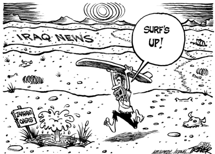
Surfing at the Oasis